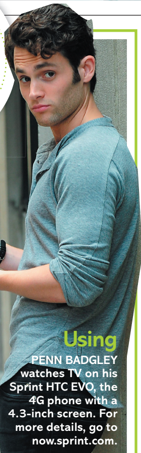
Using PENN BADGLEY watches TV on his Sprint HTC EVO, the 4G phone with a 4.3-inch screen. For more details, go to now.sprint.com .